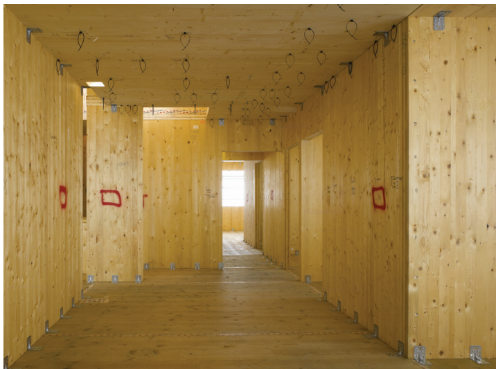
Stadthaus interior during assembly (CLT panels), Murray Grove, London, England

CLT panels consist of an odd number of layers of wood (usually, three, five, or seven). Panels are customized for each project and each cut to a precise design. Then, the panels are shipped to the construction site for assembly, where panels are fastened together. Because CLT panels are prefabricated and assembled on-site, the length of construction time can be reduced and use of CLT panels generates almost no waste onsite.