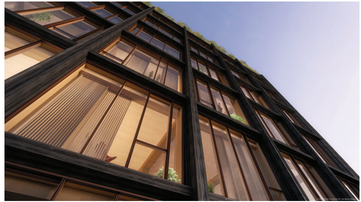
East Coast Winner: 475 West 18th, New York, NY Used by permission of SHoP Architects PC

The entire building was prefabricated off-site and completed in 49 weeks. The building sequesters a large amount of carbon due to its high wood content, and significant emissions were avoided by not using traditional building materials that generate emissions from the burning of fossil fuels during their production.