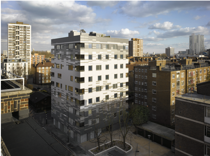
Stadthaus, Murray Grove, in London, England