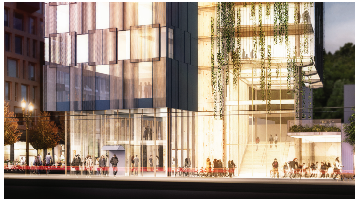
West Coast Winner: Framework, Portland, OR Used by permission of LEVER Architecture

Framework (Portland, OR) and 475 West 18th (New York City, NY) will each will receive $1.5 million to begin project work, including the research and development necessary to utilize engineered wood products in high-rise construction in the U.S.